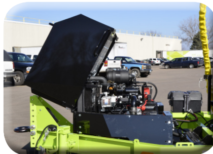
Optional engine cover