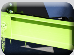
2" x 6" Frame