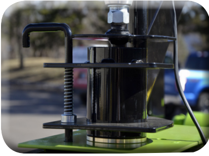
Stress-free boom rotates around hose