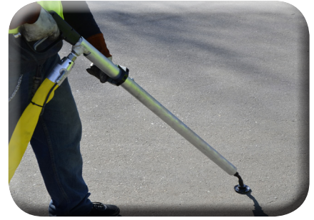
Electric heated wand option