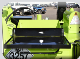
Lowest Height Largest door