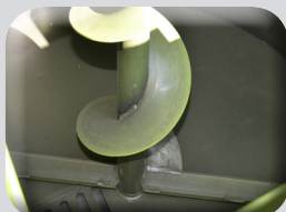
Performance Tank Design