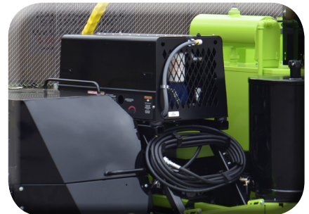
Optional rotary screw air compressor